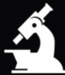
Representation in STEM jobs**