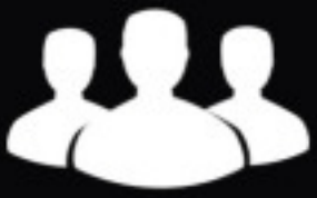
Leadership positions across 14 job sectors*